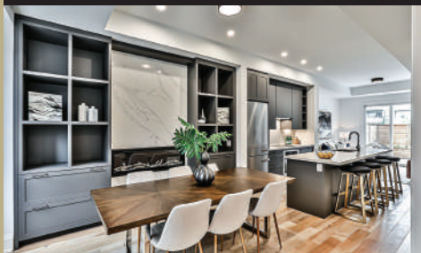
25 Dervock Crescent #3 North York, Ontario

Executive townhome located in the highly sought-after community of Bayview Village within walking distance to Bayview Village shopping, Pusateri's, restaurants and subway stations. This open concept contemporary 4 br, 3.5 bath upscale townhome is over 2300 Sq Ft with $100K in upgrades and includes 4 outdoor living spaces!