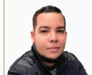
Irving, Social Media Expert

Have questions about your neighbourhood market? We are here to help!