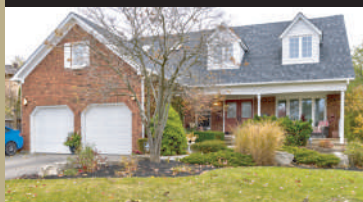
1457 Postmaster Dr Oakville, Ontario

1457 Postmaster Dr is an exquisite Cape Cod style home, a rare find on a sprawling ravine lot nestled in the highly desirable Glen Abbey neighbourhood. This beautiful home boasts 4 bedrooms, over 3,000 sqft above grade & features numerous updates throughout, including a large eat-in kitchen, setting the stage for timeless elegance in your home.