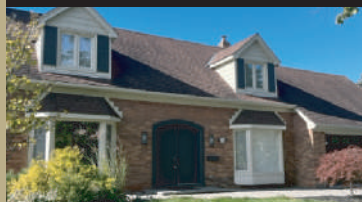
252 Walkers Line Burlington, Ontario

Located just steps away from the lake, this 4+1 bedroom 3+1 bathroom home is a fantastic opportunity to live in the highly desirable Tuck School catchment area. Upon entering this home, you'll be greeted by an inviting interior that seamlessly blends modern amenities with the timeless appeal of Cape Cod architecture. Features include updated kitchen, play-loft and saltwater pool!