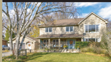
55 Hatton Dr Ancaster, Ontario

Stunning and meticulously updated home that seamlessly blends modern elegance with timeless charm. This remarkable property has undergone a full rebuild in '08 keeping only the original foundation, ensuring that every corner exudes quality and style. The outdoor oasis is truly a rare find, with a salt water pool installed in 2016. This home showcases the beauty of nature while offering plenty of space for outdoor activities and gardening in the fully fenced-in yard with separately fenced pool, adorable pool house, all surrounded by mature trees!