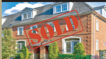
11F James St Georgetown, Ontario

Experience the best of Georgetown living in this meticulously maintained END UNIT townhome nestled in the heart of Georgetown. This 2 bedroom townhome offers the perfect blend of style & comfort. Situated in a prime location, you'll find yourself just steps from Downtown Georgetown/-Main St & a 5-minute stroll to Halton Hills Library & Cultural Centre, Dayfoot Park & Mary St Park.