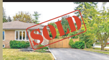
1273 Pallatine Dr Oakville, Ontario

Welcome to 1273 Pallatine Drive, Oakville - a charming semi-detached home nestled on a sprawling corner lot with a fantastic yard and no sidewalks to shovel! This well maintained home offers an array of wonderful features, is thoughtfully and tastefully decorated, and has ample space for comfortable living, providing you with room to grow and create cherished memories.