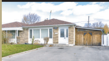
258 Avondale Blvd Brampton, Ontario

Welcome to this charming 3 bedroom, 2 bathroom backsplite home in the beautiful neighbourhood of Avondale, filled with mature trees and large lots. Complete with updated kitchen, large crawl space for storage, and insulated carport!