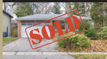
411 Chanteny Dr Mississauga, Ontario

Welcome to this rarely offered and highly desirable 3 bedroom, 2 bath bungalow nestled on a sought after cul-de-sac in the coveted Cooksville neighbourhood of Mississauga. Surrounded by custom-built homes, this residence offers a unique opportunity for those seeking a spacious home in a prime location.