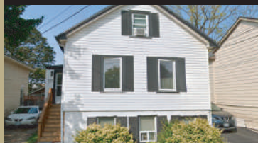
122 Montrose St N Cambridge, Ontario

This charming 1.5 storey detached home features an inground pool and numerous updates that have been thoughtfully carried out over time. Nestled in a prime location, this property offers not only a place to call home, but a lifestyle filled with amenities and possibilities. As you step outside to your private 35 by 66 foot lot, you'll immediately sense the potential that this property holds.