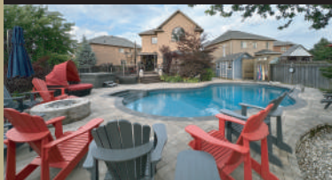
3410 Robin Hill Circle Oakville, Ontario

This rarely offered, premium pie-shaped lot in the sought-after Lakeshore Woods community is an exceptional find. The fabulously finished 4+1 bedroom executive home built by Rosehaven showcases the Wilson model, with a stunning Muskoka-like backyard! Enjoy the rest of the summer in your heated saltwater pool, installed in 2018, relax on your maintenance-free composite deck complete with a built-in outdoor kitchen, or join around the gas fire pit with plenty of room for friends & family.