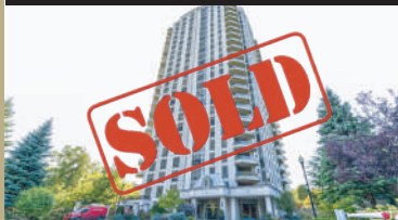
1900 The Collegeway #306 Mississauga, Ontario

Welcome to "The Palace", an aptly named residence offering an opulent lifestyle. This rarely available 2 bedroom, 3 bathroom suite in an elegant condo building features upscale amenities, including an indoor pool, party room, gym, billiard room, library, hobby room, three guest suites, car wash, and 24-hour concierge security.