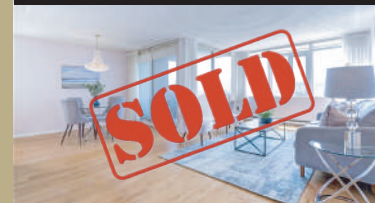
40 Harrisford St #602 Hamilton, Ontario

Discover the perfect blend of comfort and convenience in this rarely offered 3 bedroom, 2 bath condo at the highly sought-after Harris Towers! Enjoy stunning views of the escarpment which will be absolutely gorgeous with fall colours in a few short weeks from your screened-in balcony, where natural daylight floods the space through large windows.