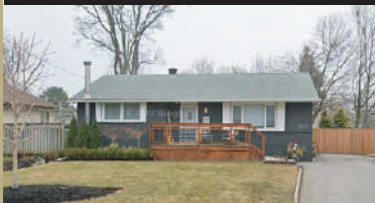
5442 Anthony Place Burlington, Ontario

This stunning all-brick bungalow, brimming with curb appeal, is nestled on a quiet family crescent in highly sought-after southeast Burlington, just steps from Lake Ontario. Situated within the prestigious Pineland and Nelson High School catchment areas, this home combines exceptional convenience with an enviable lifestyle.